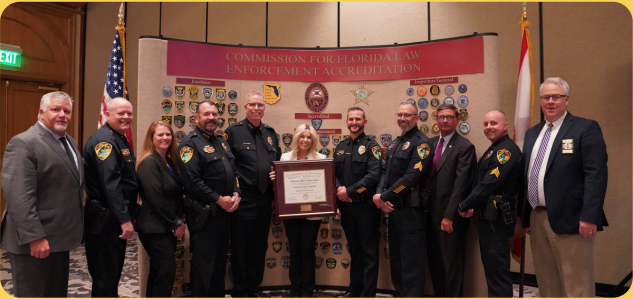
Titusville Police Department accepts excelsior accreditation status

Vehicle Burglary incidents have decreased 54.39% year over year for the time period November 1, 2024-February 1, 2025. To continue the downward trend please continue to lock your doors and roll up your windows, always park in well lit areas and never leave valuables in your vehicle.