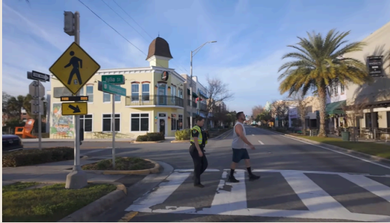
S. Washington Avenue/ Julia Street

Titusville Police Department's Traffic Unit has partnered with 'Operation Best Foot Forward' to educate drivers on Florida's right-of-way laws and curb the pattern of aggressive behavior towards pedestrians.